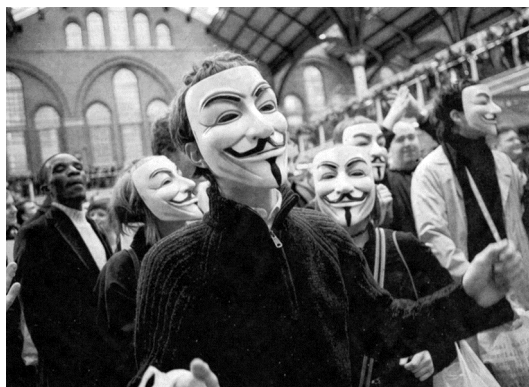
The weird phenomenon of flash mobs

7 "Why not?" say the Californians. "This is paradise, the individual set free."